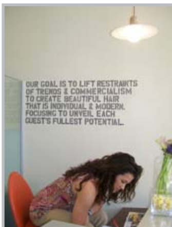
MEMO SALON 11225 Magnolia Blvd. www.memosalon.com