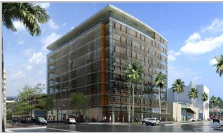
Artist rendering of NoHo Commons -- Phase Three

The NoHo Commons' third and final phase of its development project has broken ground. This third phase will include an 180,000 sq. ft. office building with ground floor retail, a seven screen movie theatre and a 700 space parking garage. It will also include the relocation and restoration of Phil's Diner, a historic diner resembling a railroad car.