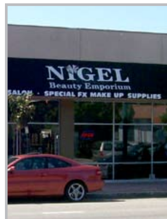
NIGEL BEAUTY EMPORIUM 11252 Magnolia Blvd. www.nigelsbeautysupply.com