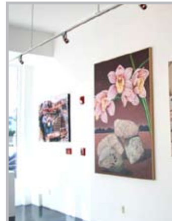
LAKE HOUSE GALLERIES 11223 1/2 Magnolia Blvd. www.lakehousegalleries.com