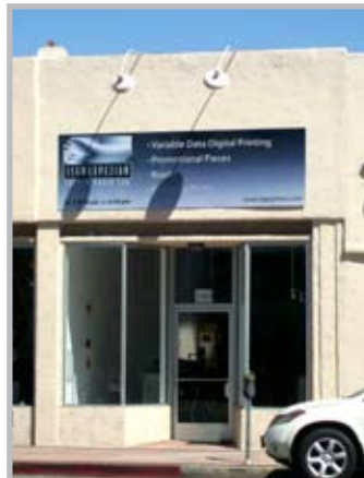
ISGO LEPEJIAN CUSTOM PHOTO LAB 11223 Magnolia Blvd. www.isgophoto.com