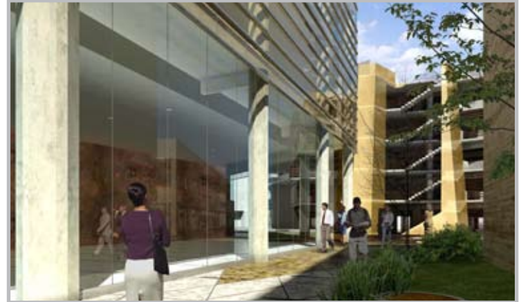
Artist rendering of NoHo Commons -- Phase Three

The $79.4 million third phase is part of an overall $375 million mixed use development. The first and second phases of the development include 730 apartments, ground floor