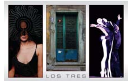
Exhibit: April 11 - October 11

CRA/LA is located at 5200 Lankershim Blvd, Suite 750. Exhibit can be viewed 9 a.m. to 4 p.m. weekdays.