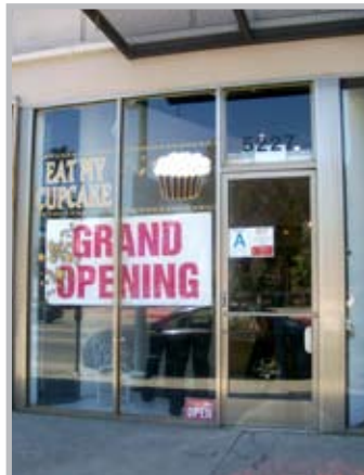
EAT MY CUPCAKE 5227 Lankershim Blvd.