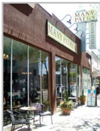
MANY PATHS BOOKSTORE 5152A Lankershim Blvd. www.manypathsbookstore.com