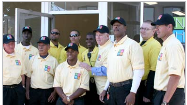
Clean and Safe Teams pose with Councilman LaBonge

Have you seen the men and women wearing bright yellow shirts riding bicycles and cleaning the streets along Lankershim and Magnolia, lately? They are the new Safety Ambassadors and Clean Team for the NoHo BID. Clad in bright yellow and black you can't miss them or their contribution to creating a vibrant and exciting North Hollywood.